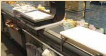
Hanging bar for bags