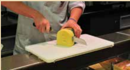
Polyethylene cutting board

The motivation behind Carrier Commercial Refrigeration's new solutions is to significantly reduce energy consumption and maintain consistently high performance. The use of high-performance fans and fan speed control saves energy, reduces operating costs and respects the environment. Developments include a new control unit that drives the performance characteristics of the overall unit to ensure efficient operation.