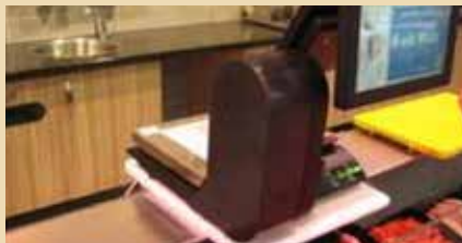
Scale / slicer platform