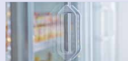
Pleasant to touch, comfortable door handles