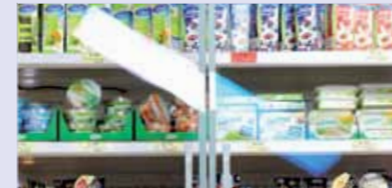
A transparent argument: comparison between all-glass and anti-reflective all-glass versions