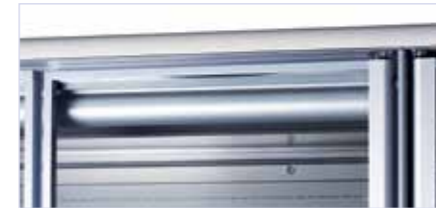
Elegant, slender frames allow an unobstructed view