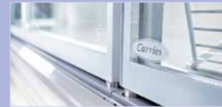
Perfectly designed down to the smallest detail