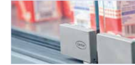
Resilient metal door hinges with an opening angle of 90° and hold-open function