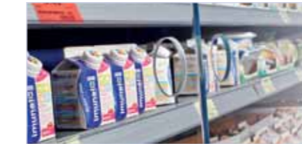
Practical handle-free grip openings ensure maximum transparency