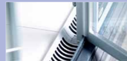
Resilient door hinges with an opening angle of 90° and automatic hold-open function