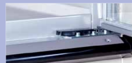
Integrated door lock