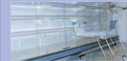
Carrier doors made of single-pane tempered glass also undergo stringent durability tests (over 150,000 open/close cycles), collision and transportation tests