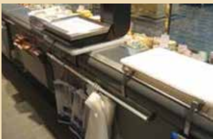
Hanging bar for bags