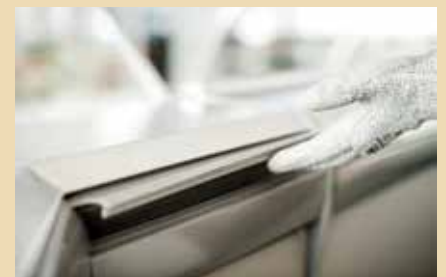
Soft tummy bumper profile