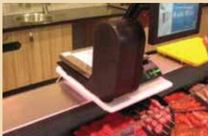
Scale / slicer platform