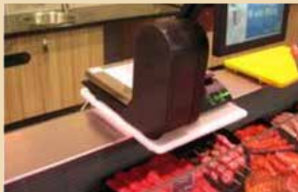
Scale / slicer platform