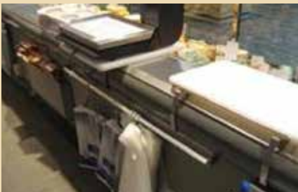
Hanging bar for bags