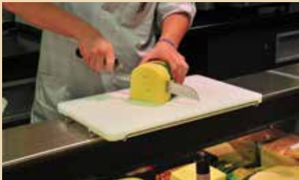
Polyethylene cutting board

The motivation behind Carrier Commercial Refrigerations new solutions is to significantly reduce energy consumption and maintain consistently high performance. The use of high-performance fans and fan speed control saves energy, reduces operating costs and respects the environment. Developments include a new control unit that drives the performance characteristics of the overall unit to ensure efficient operation.